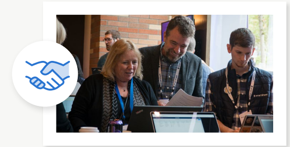
First ENGAGE customer conference